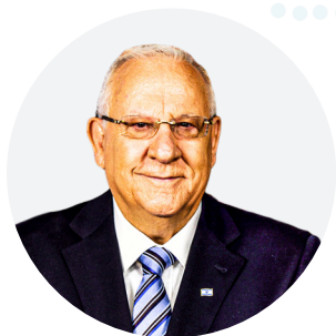
Reuven Rivlin President of Israel

"This book, reprinted almost a century since its last publication, is of particular importance. It helps the Russian-speaking Jews to get a better understanding of Jabotinsky's best publicist works. Jabotinsky's teachings fit perfectly with the critical work of the Euro-Asian Jewish Congress, which focuses on helping the Jews of the former Soviet Union and encourages Jewish identification, Zionist awareness, and immigration to Israel."