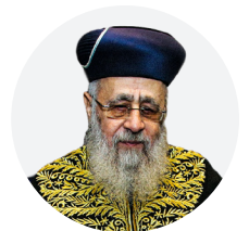
Yitzhak Yosef Rishon LeZion, Chief Rabbi of Israel