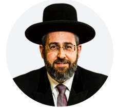
David Lau Chief Rabbi of Israel, President of The Chief Rabbinic Council

May the Almighty continue to support you next year in your extremely important and fruitful activities for the benefit of communities and the whole nation. May you help more and more Jewish people to embrace the wisdom of the Torah and the beauty of our tradition. And may we all be awarded a good year and the early arrival of Mashiach!